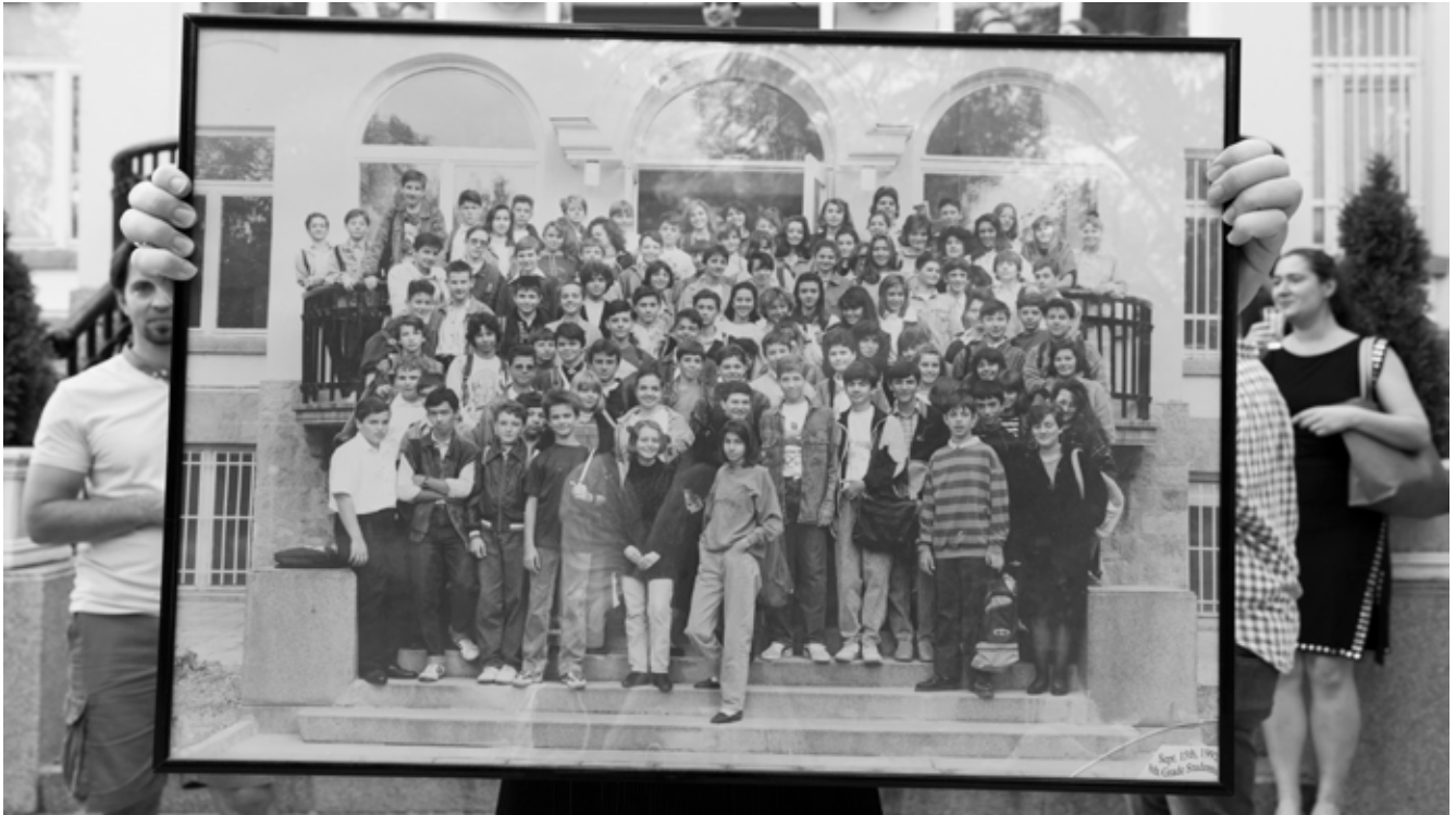
The Class of 1997 in 2017 holding their 1992 prep photo

When addressing the incoming 8 th graders at ACS on 15 September, we make it a point to outline what being an alumnus or alumna of the American College of Sofia is. It is both a goal for them to strive for through Graduation and a reminder to us why ACS exists – to help turn the talented young minds not just into good students with excellent grades, but also into accomplished, well-rounded and good people; people who are strong leaders with a sense of civic duty. In one word – alumni.